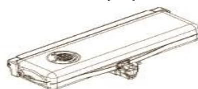
Standard brackets for top and bottom hung windows