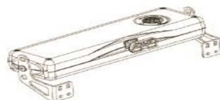
Large swivel brackets set for top hung windows